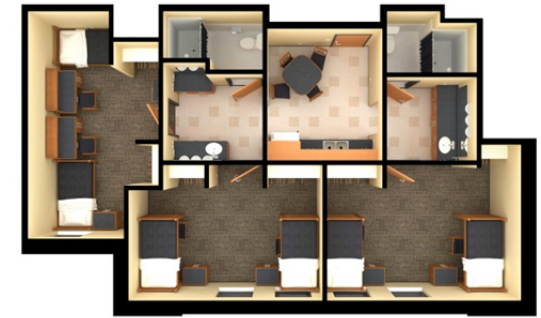
Total of 15 suites available

Three Bedroom Suites Rooms: 188 – 205 ft 2 6 Residents 2 bathrooms w/ shower 2 sinks 3 vanity stations Kitchenette • Full Refrigerator • Microwave • Sink • Cabinets • Table/chairs