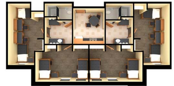
Total of 32 suites available

Four Bedroom Suites Rooms: 186 – 210 ft 2 8 Residents 2 bathrooms w/ shower 2 sinks 4 vanity stations Kitchenette • Same as above