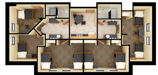
Total of 6 suites available

Five Bedroom Suites Double rooms: 188 – 205 ft 2 8 Residents 2 private rooms ~ 120 ft 2 2 bathrooms w/ shower 2 sinks 4 vanity stations Kitchenette • Same as above