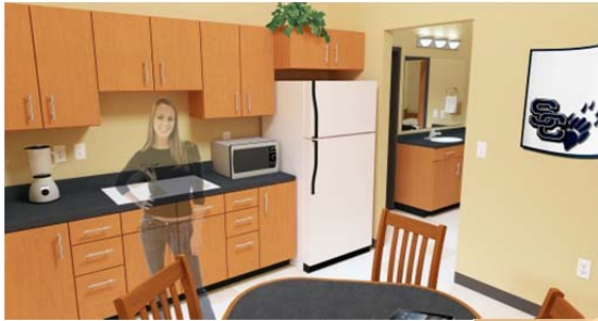
Kitchenette, with microwave, but NO stove/oven