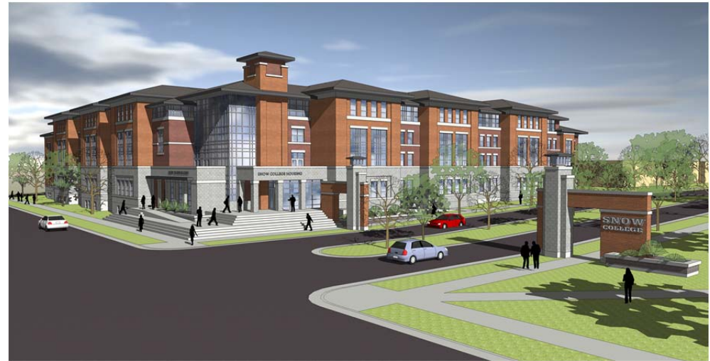
Residential Life Suites