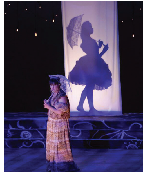
It's About You