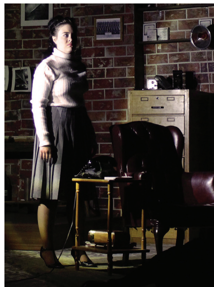
It's About You