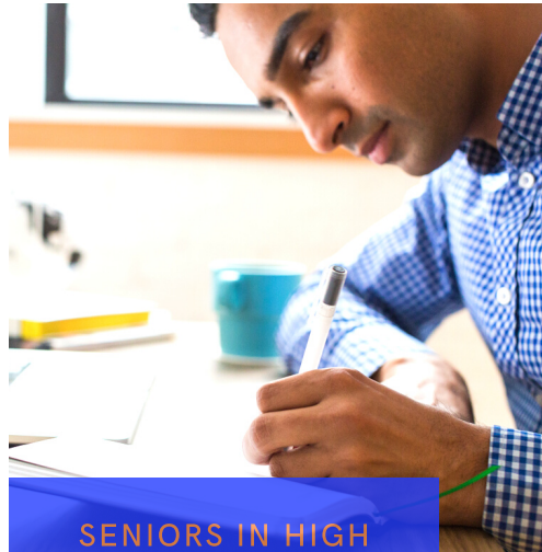
SENIORS IN HIGH SCHOOL