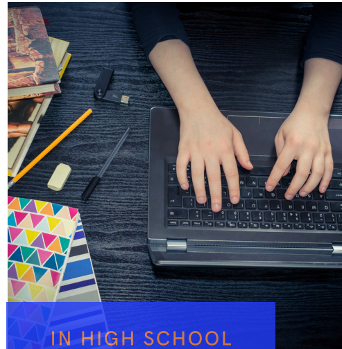
IN HIGH SCHOOL 9TH-12TH