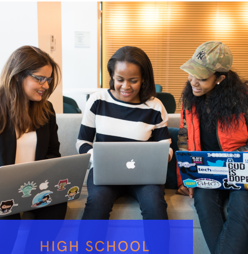
HIGH SCHOOL GRADUATES

Required documentation for admissions - Send to AOLtranscripts@snow.edu